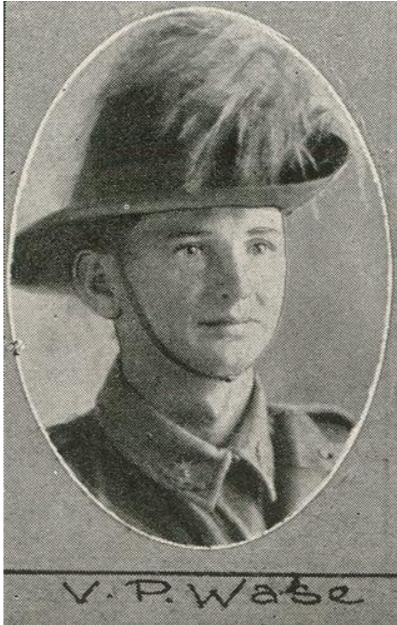
( The Queenslander Pictorial – 15 April, 1916)