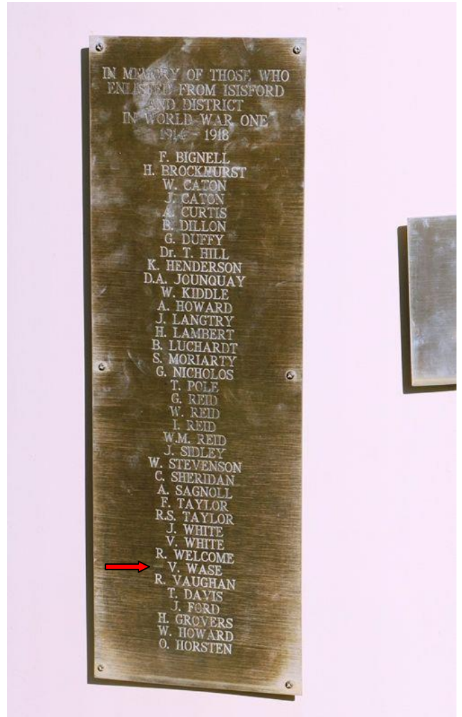
Isisford War Memorial