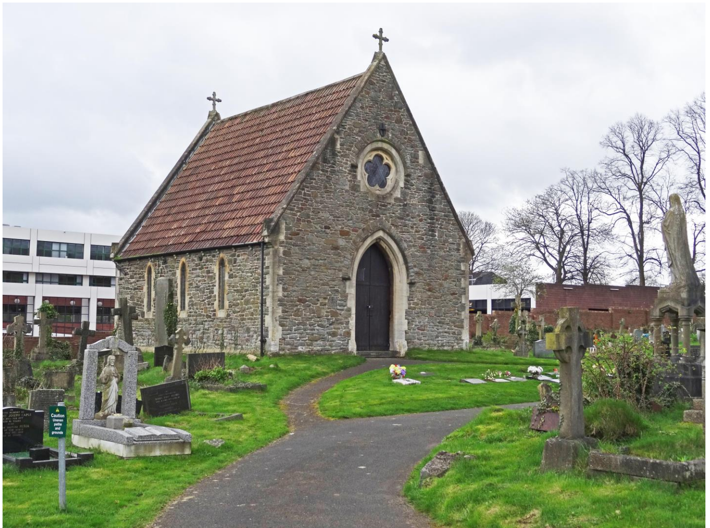
Holy Souls Roman Catholic Cemetery