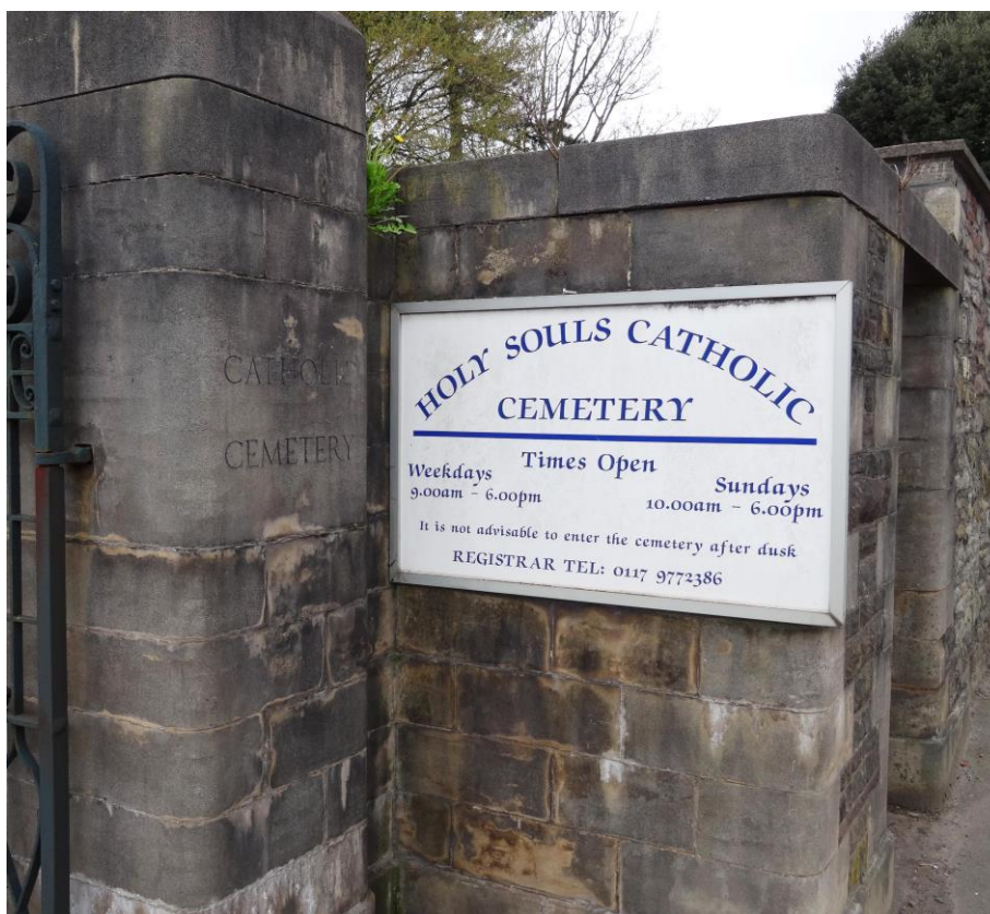
Holy Souls Roman Catholic Cemetery